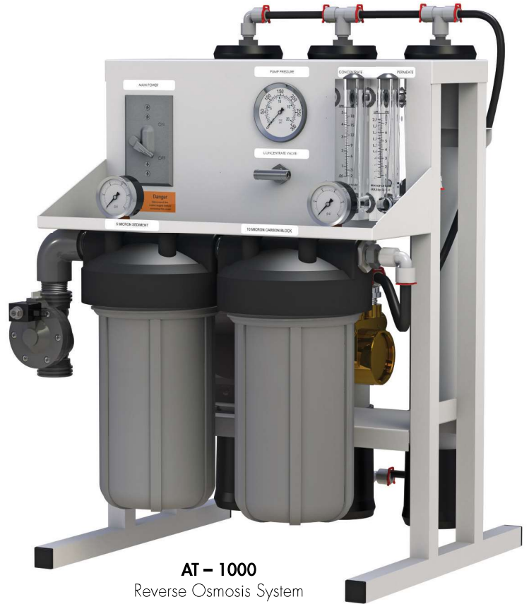
AT – 1000 Reverse Osmosis System

can also be upgraded for higher recovery rates by adding the concentrate recycle option.