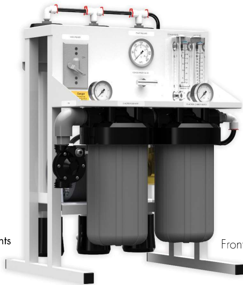
AT – 1000 Reverse Osmosis System